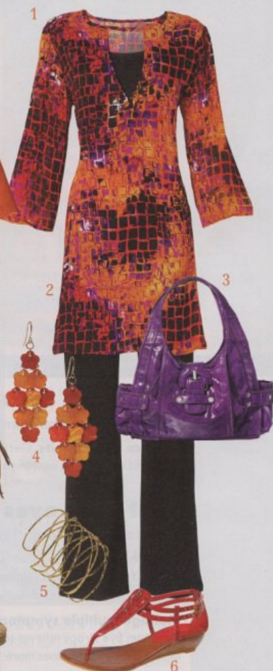
1. Top, $50, sizes S-XL; sag-harbor.com. 2. Pants, Joseph A., $68, sizes S-XL, $78, sizes 1X-3X; at Lord & Taylor. 3. Bag, $42; shop4sparkles.com. 4. Earrings, M. Haskell, $22; 212-764-3332. 5. Bracelet, $8; at Fashion Bug. 6. Sandals, Candies, $49, sizes 6-10; at Kohl's.

3 Streamline your shape with a longer length