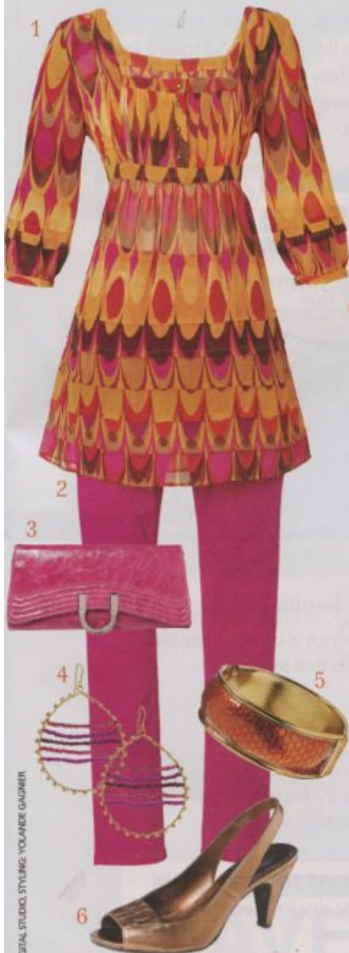
1. Top, $68, sizes S-XL; sohocompagnie.com for information. 2. Pants, $17, sizes 2-12; at T.J. Maxx. 3. Bag, Candies, $42; at Kohl's. 4. Earrings, $15, and 5. Bracelet, $18; allthe rageonline.com. 6. Shoes, AK Anne Klein, $76, sizes 6-10; qvc.com.

1 Go mod in a bold print and bright jeans